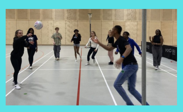
Netball at NU Foundation