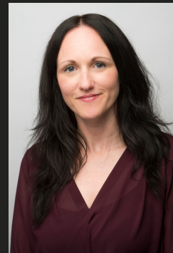
Louise Peart History

Generally I'm not the most "active" of people. I can't say I've used lockdown to suddenly transform myself into Mo Farah! So for me it's been a nice long walk with the dog every day. He's loving lockdown!