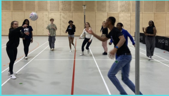
Netball at NU Foundation